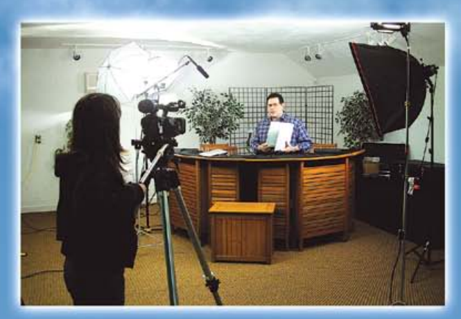
The TV Studio Students shoot their productions here