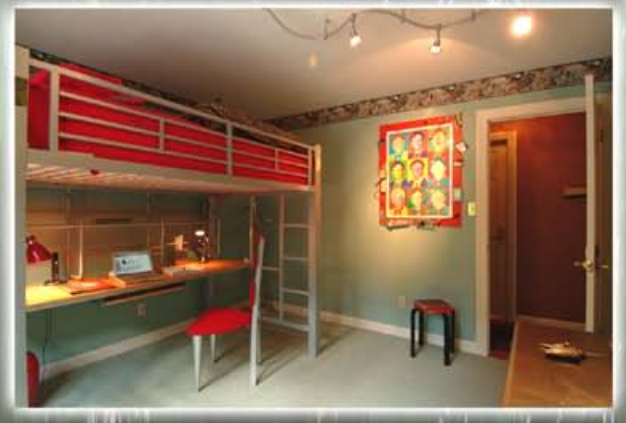
The Technogeek Room Bill Gates watches over you in this high-tech room