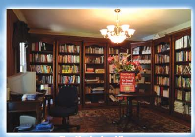
The Marketing Library One of three large libraries at the Retreat Center