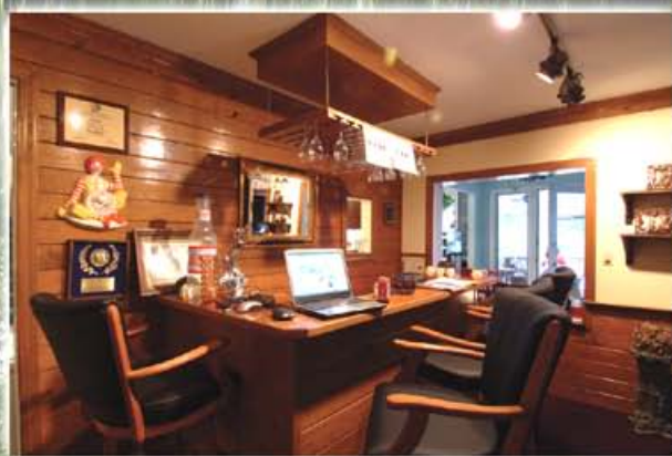
The Blog Bar Don't forget to tip your blogtender Ha! Ha! Ha!