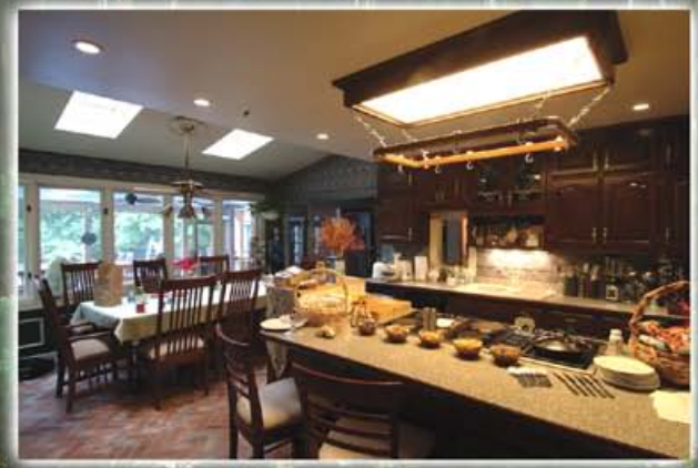
The Kitchen More food than a cruise ship