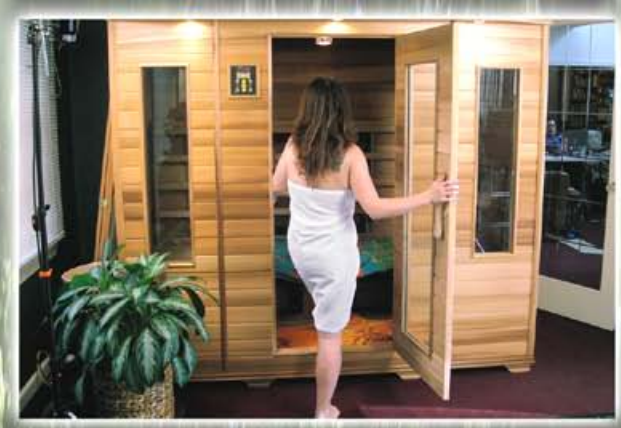
The Sauna Enjoy a little relaxation and rejuvenation