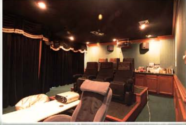
The Theater Action on the screen makes the floor shake