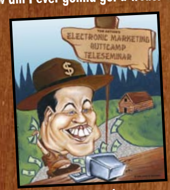
ButtCamp is born