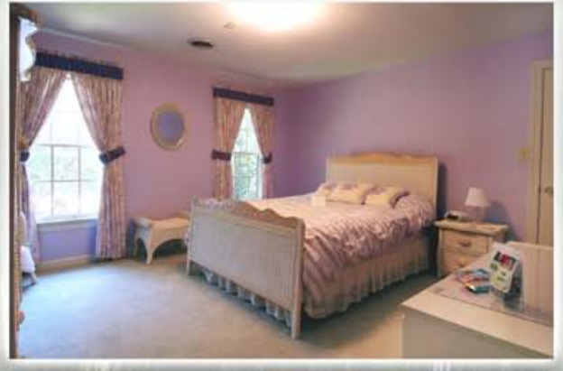
The Lavender Room Tom calls it the "Spyware" Room